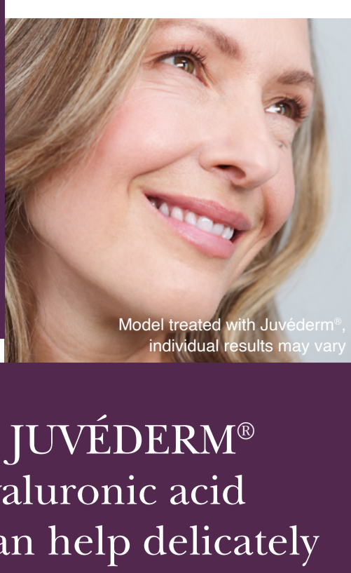
Model treated with Juvéderm ® , individual results may vary

Products in the JUVÉDERM ® collection of hyaluronic acid facial fillers 1-8 can help delicately refresh your features by: