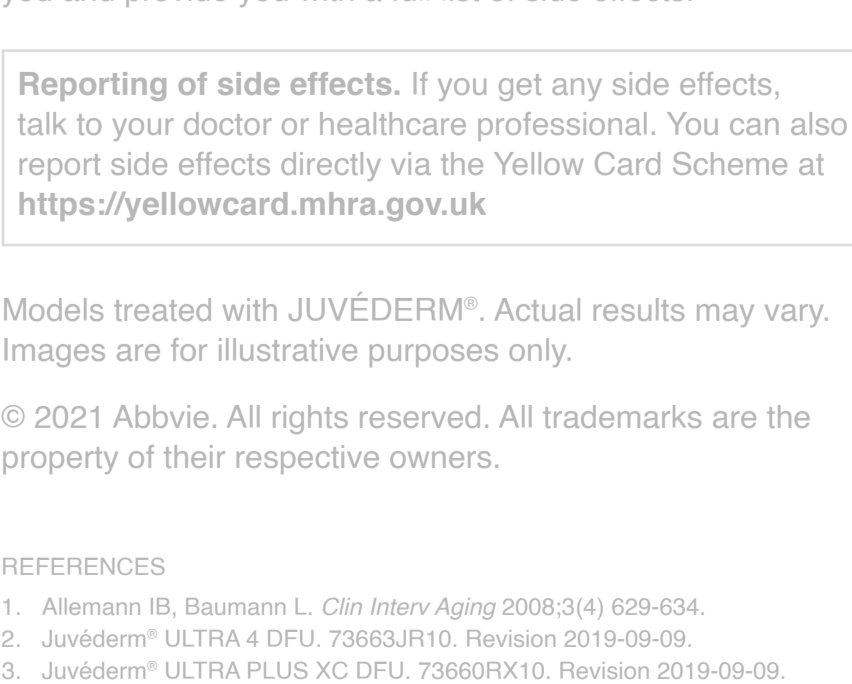
Model treated with Juvéderm ® , individual results may vary

It's all about still looking like you – whether you're smiling, laughing or frowning. During your consultation, your practitioner will assess your face whilst it's still (static) and moving (dynamic) with the aim of giving you a result that can look and feel natural. 20